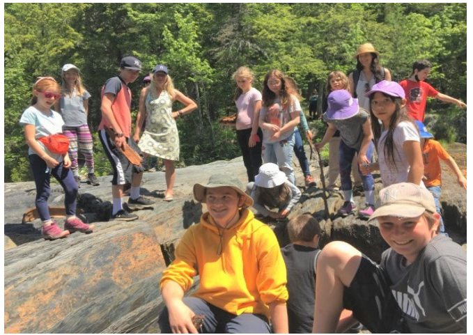
Last year at Kejimkujik

With the annual flower ceremony, we will be including a Child Dedication ceremony for the children in our congregation. This is a time to express our hopes for the children while promising to support and nurture them. Be sure to practice our song for singing the children out "It Takes a Whole Village" in order to be well versed for the ceremony.