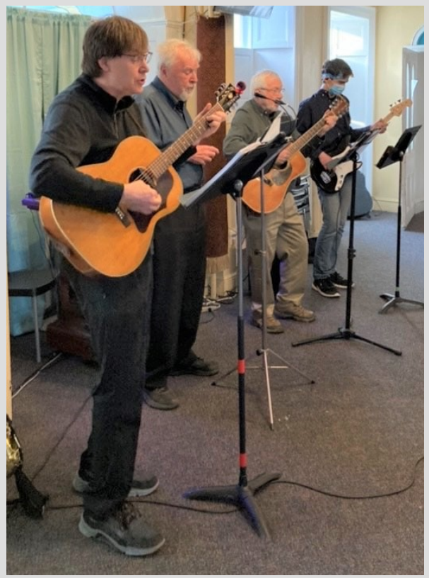
Our Afterchoir doing their beautiful thing at the Coffeehouse

Thank you to everyone who participated in the coffeehouse! It was a great time of music, art, and poetry.