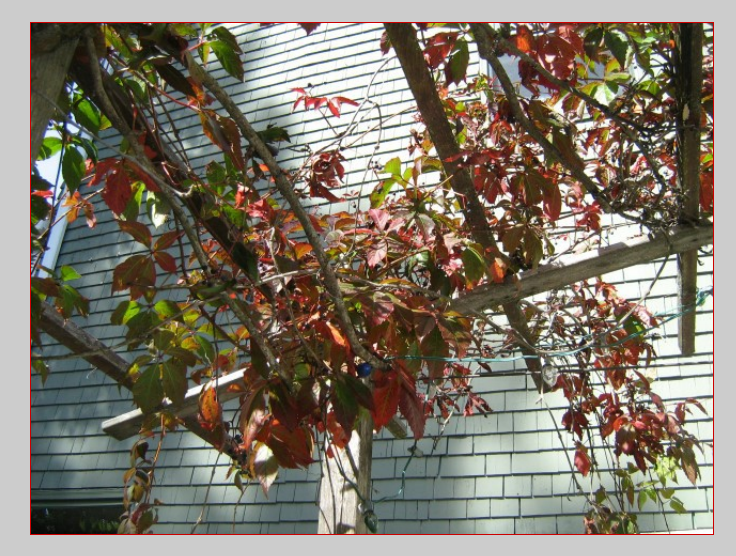
Trellis over our former deck at 5500 Inglis Street