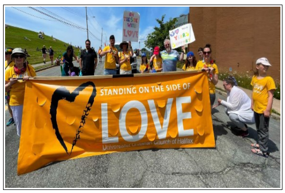
Coming down Rainnie Drive