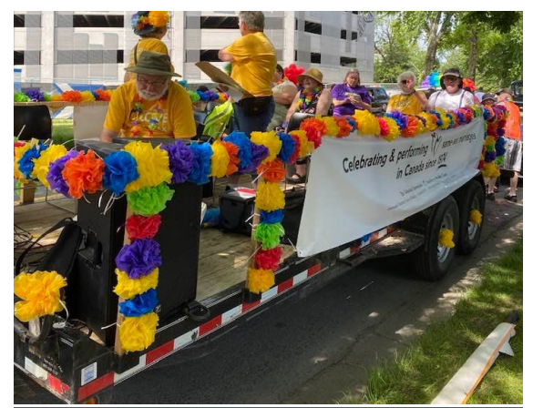
And they're off!