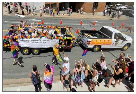
Oh, the adoring crowds