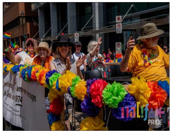
What fun, what a happy day!