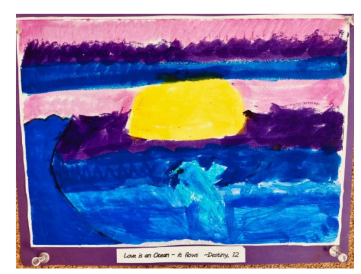
Love is an ocean, it flows. Destiny, 12