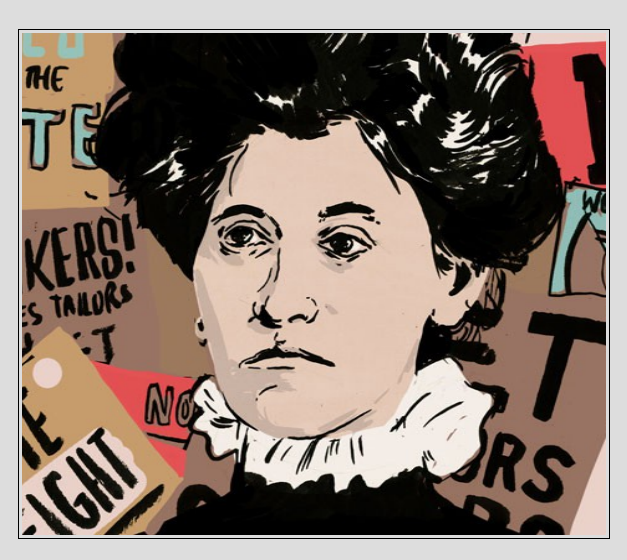
Theresa Malkiel May 1, 1874 – November 17, 1949 The woman behind International Women's Day Click here for full bio on Wikipedia