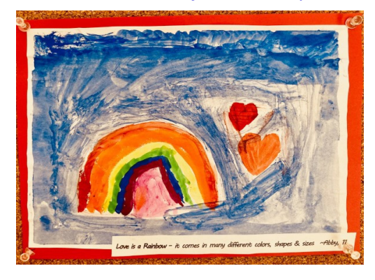
Love is a rainbow – it comes in many different colours, shapes & sizes. Abby, 11