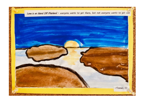
Love is an Island Off Mainland – everyone wants to get there, but not everyone wants to get wet. Tristan, 13