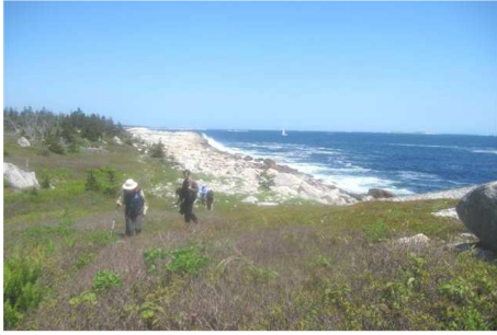
UUs on this trail in June 2013

The April hike will be to Crystal Crescent Beach and beyond, along the coast towards Pennant Park. I think the road will still be gated so the hike will begin on a gravel road, then on to a graded trail and boardwalk that leads to Third Beach. Beyond Third Beach the trail is unimproved but is generally dry. The trail offers great views of the ocean and Sable Light.