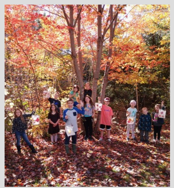
Cover photo, UUCH children & youth