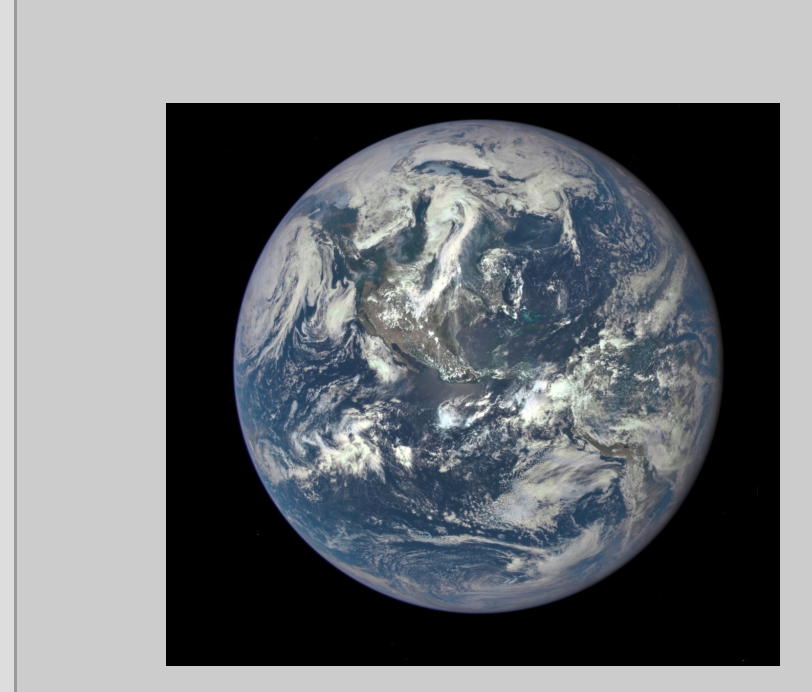
Our Beautiful Blue Boat Earth Day April 22