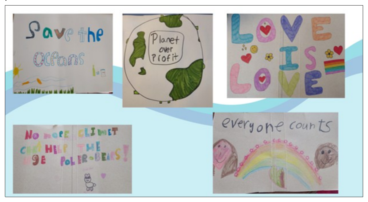
Artworks of our creative, aware children and youth.

We've been considering the pressing issue of climate change and how it is connected to the many varying concerns the children demonstrated when exploring activism. Our first outing of the season touched on the concerns of pollution, animal welfare, forest fires, logging, healthcare and, of course, climate change. We visited a sustainably managed forest; throughout our walk along a forest trail, we explored empty tree trunks, mossy branches and icy puddles. We also explored the role forests play in habitat, biodiversity and carbon sequestration.