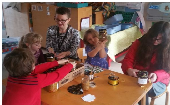
RE fun times