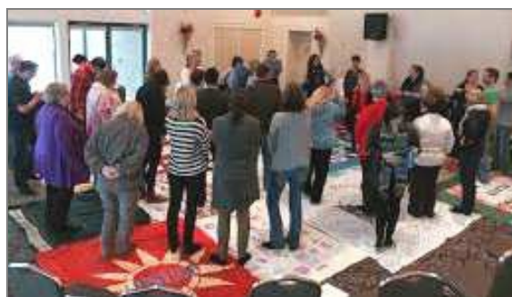
A Blanket Exercise held at a BC school

UUs and Quakers are working together to bring us all a special experience. The service on February 28th will be followed by a communal meal of simple but hearty soup and bread. After the meal everyone will be invited to participate in an enactment of the Blanket Exercise developed in 1997 by the ecumenical Aboriginal Rights Coalition, now a part of Kairos.