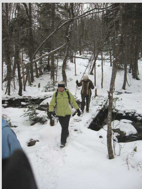
A former UU hike on this trail.

On my last visit, I saw that a beaver dam across the outlet stream has raised the level of the lake by 30 to 50 cm, making the trail wet in spots. The hike is along undeveloped hiking and mountain bike trails.