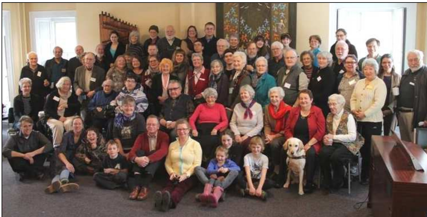
These are some of the beautiful people of the wonderful Universalist Unitarian Church of Halifax.