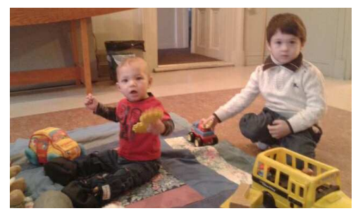
Tots at the first playgroup, January 22nd

Something new is happening at 5500 Inglis Street: the Parents & Tots Coffee House and Playgroup. This is a time for parents and their small children (aged newborn to 3 years) to gather and share stories, news, coffee and snacks. There are toys for the children and coffee for the adults. Small snacks are provided.