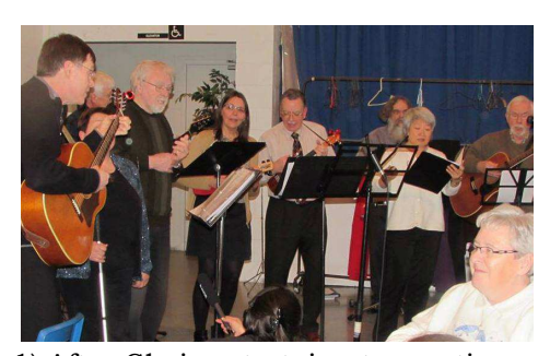
1) After Choir entertain at reception;