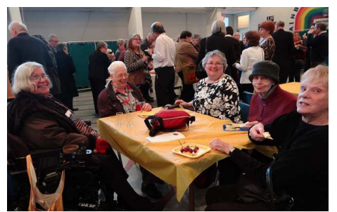
2) Reception guests;