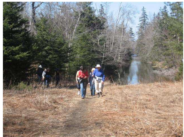
UUs on this trail in 2010

The January hike will explore the Shubie Canal structures on the northern end of the Shubie Multi-use Trail in Dartmouth. We will follow the old canal route as it flows from Lake Charles to Lake Williams, visiting the ruins of the dam that marked the end of Lake Charles. This dam supported inclined ramps that formed the foundation of a marine railway that carried boats between the lakes. The marine railroad was driven by a hydraulic turbine that was powered by the mill race that runs beside the inclined plane.