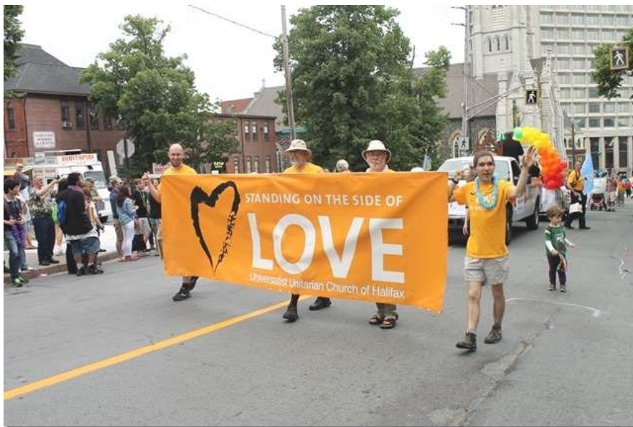
UUCh in the Halifax Pride Parade, July 2013

Pride photos courtesy of Avarid Woolaver