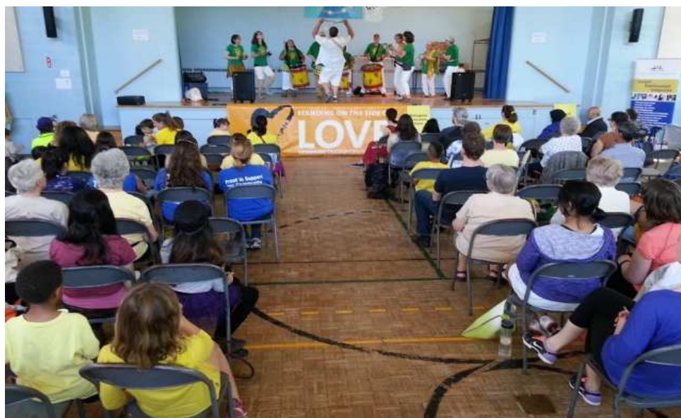
Saint Andrew's church hall, where there was a welcome from Mi'kmaq women singers, musical performances by Samba Nova and speeches from former refugees and sponsors. A plentiful supply of lemonade there was much appreciated.