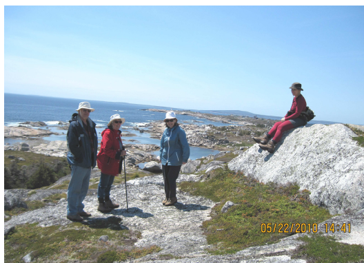
A UU group at Polly Cove, 2010.

The June hike will be to the granite outcrops on the coast between West Dover and Peggys Cove. In this area there are offshore islets battered by Atlantic seas, sheltered coves and great views of the Peggys Cove light from a distance. The trails are mostly smooth granite outcrops separated by crossings on peaty soils that can be wet following rains.