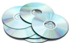
CDs & DVDs