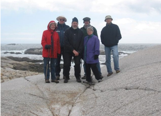
A UU group on a former Prospect hike

On Saturday June 24th, we will enjoy a coastal walk that begins in the charming village of Prospect. This hike has great views, and passes by interesting rock formations as well as small streams and ponds. It also contains a memorial to the company of the HMS Tribune which was wrecked on these shores as it returned to Halifax after participating in the burning of the White House. The trail is relatively flat with some muddy sections.