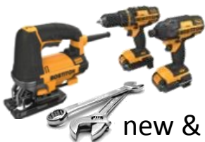
new & unopened tools