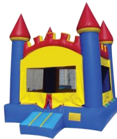
Bouncy Castle, Music and Lemonade