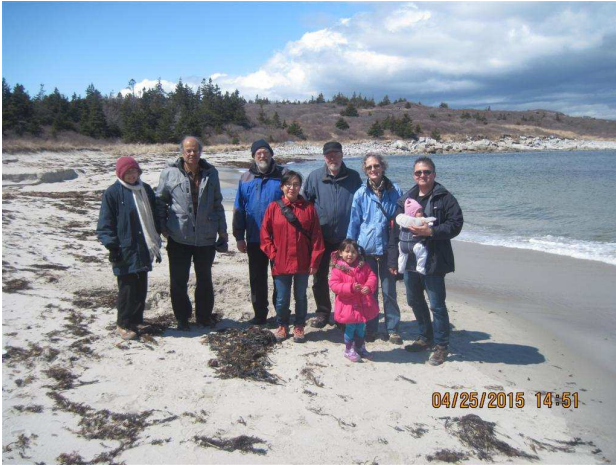
UU hikers on this trail last April.

The March hike will be from Crystal Crescent Beach to Pennant Point. The hike starts on a graded trail and boardwalk that leads to Third Beach. Beyond Third Beach the trail is unimproved but is generally dry; however, there are two or three streams and bogs to cross. This is early in the hiking season so we may encounter winter storm damage to the trail.