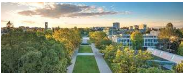
UBC Campus, site of CUC's 2016 Annual Conference and Meeting

If you've never been to a national conference of our church, don't miss the chance to attend the Vancouver one on the Victoria Day weekend, May 20-22. Spending a weekend with Unitarians from across Canada is an unforgettable experience!