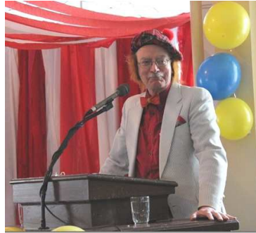
P.T. (Norm) Barnum himself