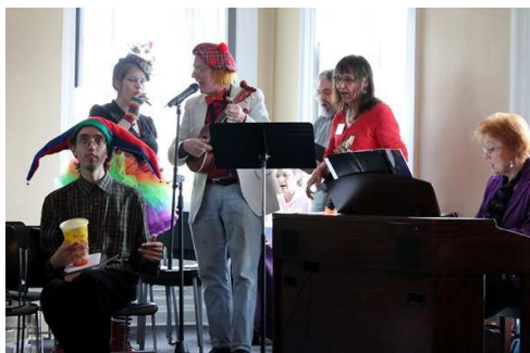
The Troupe ... the humour, the pathos