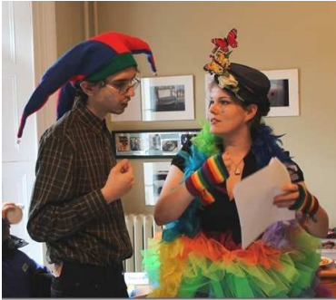
Last minute instructions

The advance publicity had it right; we were amazed, enchanted, mystified and amused! We were re-acquainted with our inner clown. Importantly, we were reminded of the inhumane treatment of performing animals. The RE kids, both the young and the not-so-young, showcased their impressive talents—and collected $150 for the Performing Animal Welfare Society. Just how any future service at UUCH can ever 'top' The Greatest Show on Earth cannot be imagined.