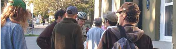
Lining up for supper at Hope Cottage

Wednesday, May 7th is our next Hope Cottage dinner date, for which the UUCH has been asked to supply sufficient hot food to nourish 80 or more hungry residents of our local community.