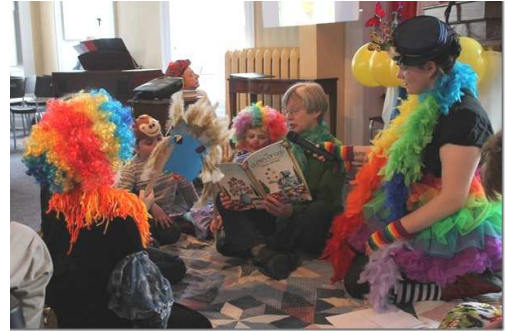
Circus performers and lions like stories too