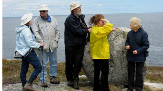
A UU group at Duncan's Cove, May 2008

Approaching Halifax Harbour from the sea, your eyes are drawn to the high white granite cliffs guarding the harbour entrance. The hike along these outcrops from Duncan's Cove to Ketch Harbour is one of the greatest shoreline walks anywhere.