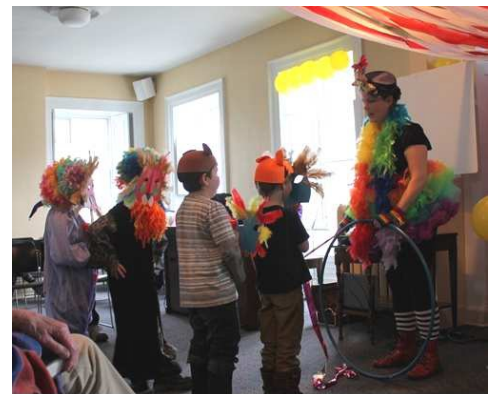
Lions performing in the center ring