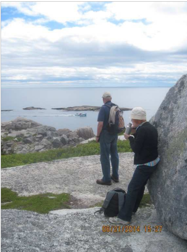
UU hikers at Polly Cove, May 2014

The May hike will be to the granite outcrops on the coast between West Dover and Peggy's Cove. In this area there are offshore islets battered by Atlantic seas, sheltered coves and great views of the Peggy's Cove light in the distance. The trails are mostly walking on smooth granite outcrops that are separated by crossings on peaty soils that can be wet following rains.