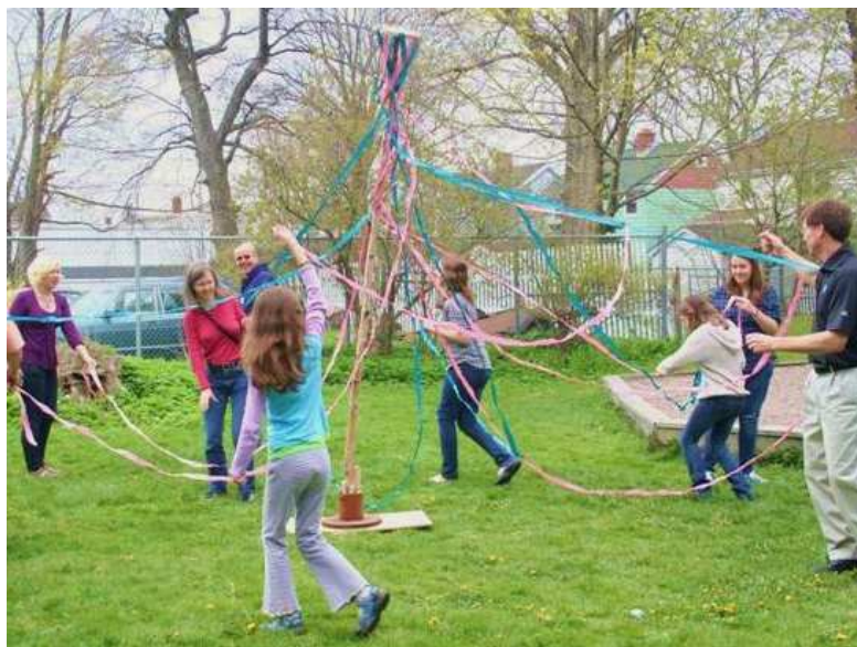
UUCH Maypole 2010