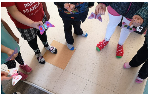
And we made butterflies too

We have begun by learning about the carbon cycle, the mutually beneficial cycle between all living beings and our planet's atmosphere. The children have created a terrarium, or "world in a bottle" to take home as a concrete example of balance in an ecosystem.