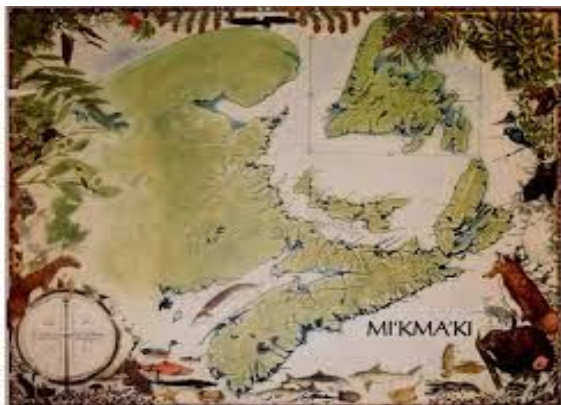
Historical map of Mi'kma'ki territory

While Canada's Indigenous peoples are an example of strength, determination and resilience—their leaders influencing everything from environmental conservation, to arts and entertainment, to justice and politics, to how we understand our spiritual connection to creation—the pain and suffering they have endured, inflicted systematically by our government and its institutions, is not a thing of the past but remains the cause of tremendous challenges for Indigenous communities everywhere in Canada. It is also a contributing factor in the dis-“ease” and the dis-“chord” experienced today by many of us Canadians of European ancestry, and probably also by Newcomers.