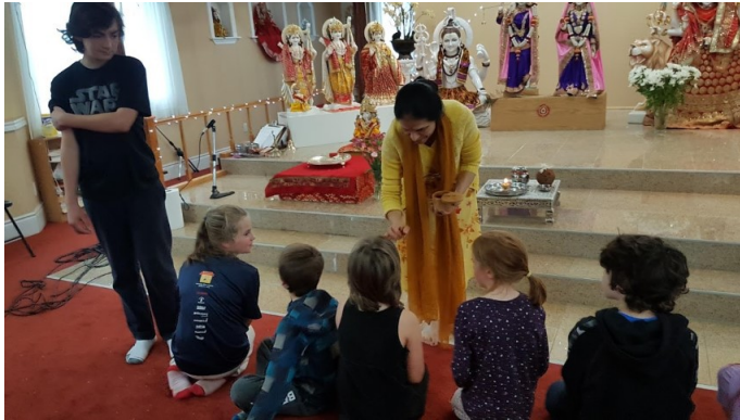
Our UU children receiving the tilak blessing at the Hindu Temple

From Diwali to Samhain, with plays and crafts, gathering at a Hindu temple and for a multi-generational service, October has been an engaging month of exploration, community and creativity.