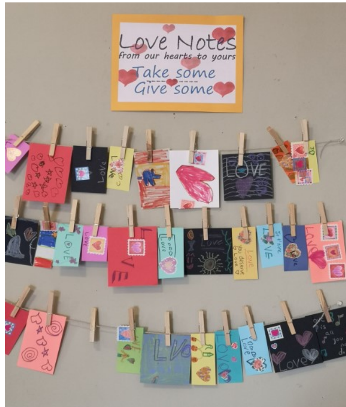
Cards made by RE kids & youth to send to our people when a little extra love is needed. A few are available in the Ballroom for your use. Spread the love!