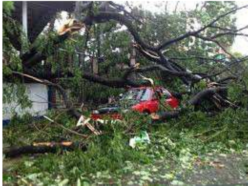
A typical Hurricane Juan scene.

Unfortunately, Hurricane Juan took aim at Halifax on the evening of Monday, September 29, less than 5 days before our fellow UUs would arrive in the city. We had to change the meeting venue and several of the delegates were billeted in homes still lit by candles but the gathering went on as scheduled.