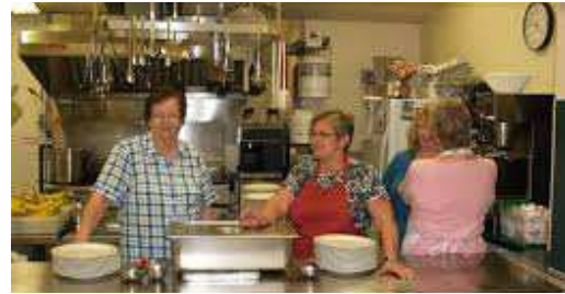
Supper time staff at Hope Cottage.

Consequently, 'letting this go' and possibly seeking out new opportunities for the UUCH to partner with other groups involved in feeding the hungry within HRM seems the best approach, given the feedback I've received from faithful supporters within our congregation.