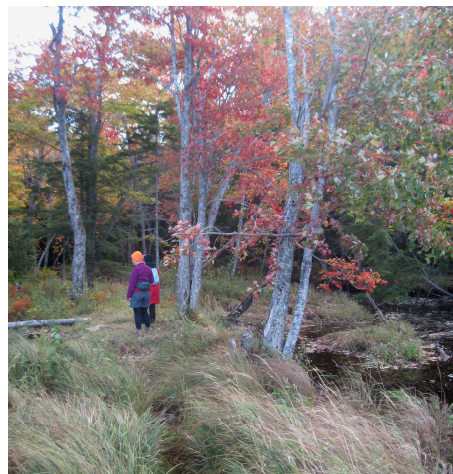
UUs on this trail in 2012

The October hike will be to Sandy and Marsh Lakes. These lakes are part of the Sackville River watershed and are located in the back country west of the Bedford Rifle Range. I hope the fall colours will still be on display. This hike follows woodland hiking trails as well as service roads under power lines. The service road under the power line can have some wet sections.