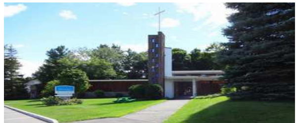
Beaconsfield United Church, Beaconsfield, QC