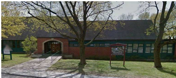
Lakeshore UU Church, Lachine, QC

A one-day event with optional activities Saturday evening and Sunday morning worship, hosted by Lakeshore UU Congregation. Saturday’s program takes place at Beaconsfield United Church, 202 Woodside Rd, Beaconsfield QC.