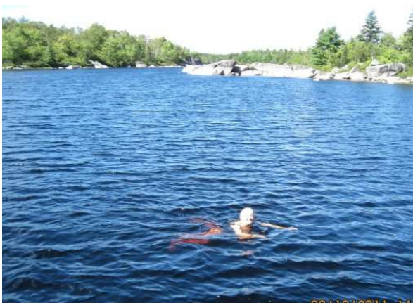
A UU group at Suzie Lake, September 2011

The trail is somewhat rough, with granite outcrops in some places, and muddy at times—but more frequently through mature forests. It is of moderate difficulty with respect to roots and rocks.