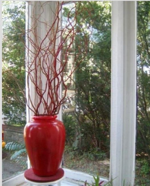
Floral art by Valerie Chapman