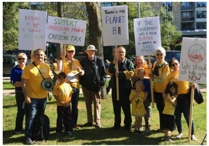
UUs at Victoria Park for Climate Strike

Worldwide, it was the largest climate change demonstration ever seen. Local UUs across Canada rallied to show support for the youth-led Global Climate Strike , and Halifax was no exception. About a dozen UUs and friends made signs then carried them amongst the throngs of marchers, many of us wearing our yellow 'On the Side of Love' T-shirts.