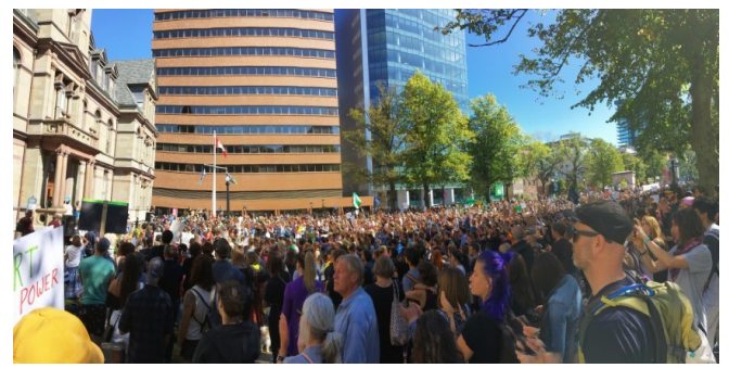
Climate Strikers at City Hall, filling the Grand Parade

Halifax Regional Police estimate about 10,000 people marched from Victoria Park down Spring Garden and on the Nova Scotia Power headquarters. The march began at 11 am and continued for a couple of hours before finishing up with speakers at the Grand Parade. This was the largest climate protest in Halifax history.