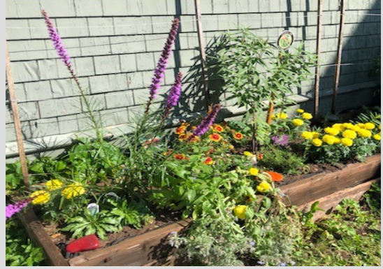
The children's butterfly garden in the church's backyard is in full bloom! We've spotted Monarch butterfly eggs in the milkweed over the summer.