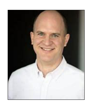
Minister's notes ...